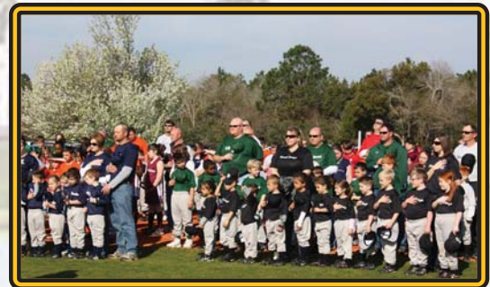
Little league opening day.

The Walton County School District offers excellence in education in a small school atmosphere. Designated by the State Board of Education as a High Performing School District for the last five consecutive years, our school district is distinguished among other Northwest Florida districts. Various academic, civic, and sports programs provide your children many opportunities to learn and grow.