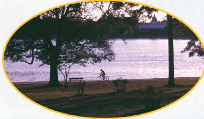
View of Lake DeFuniak with the Chautauqua Hall of Brotherhood in the background.