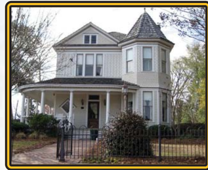
Historic home on majestic Lake Defuniak.

DeFuniak Springs offers historic charm with modern family conveniences. From rural homes with acreage that offer privacy and space to roam to planned communities with amenities located close to parks and schools, your family is sure to find DeFuniak Springs a beautiful place to call home. Ideally located in Northwest Florida, we are within an hour's drive of Pensacola, Panama City, Marianna, Dothan, and only minutes from the beautiful Beaches of South Walton.