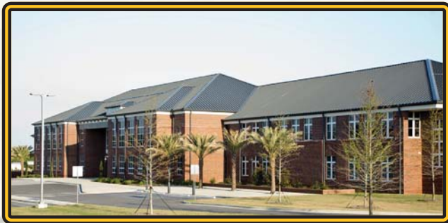
Brand new Walton High School, Home of the Braves.