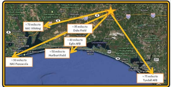
Map illustrating drive times to the area bases.

Northwest Florida State College also has a campus located in DeFuniak Springs, providing a full range of college services and programs. Diversified college credit and non-credit programs, including 2-year degrees, adult education, GED preparation, college preparatory, and recreational and leisure courses are offered during the day and evening. The center provides admissions, registration, financial aid information, placement testing, and academic counseling services. The center also houses two computer labs, a career center, small conference facilities, and a child care center.