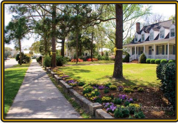
The path circling Lake DeFuniak.